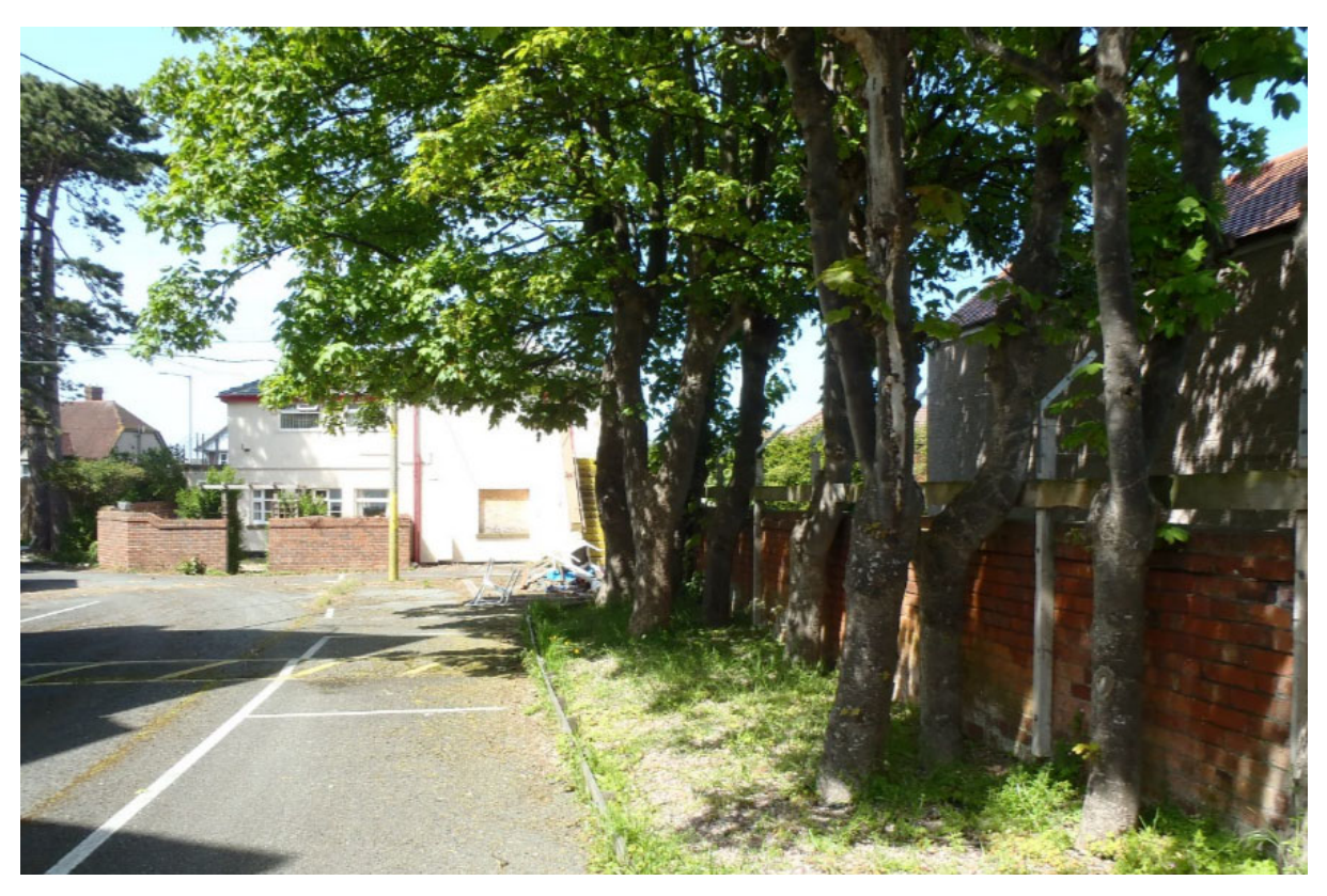
10. View from within site looking out to road; gate and temporary hoardings

9. Looking to side boundary with Footpath and Nursery beyond; annex building at the front of site (detached white building at the far end of photo)